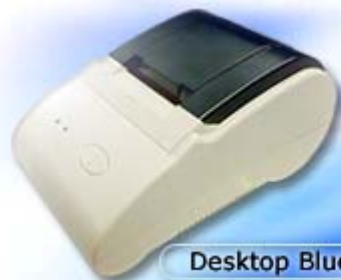
Desktop Bluetooth Printer

eFresh Mobile can be configured to work with any battery operated mobile printers for street vendors and taxi drivers or desktop printers for normal stores.